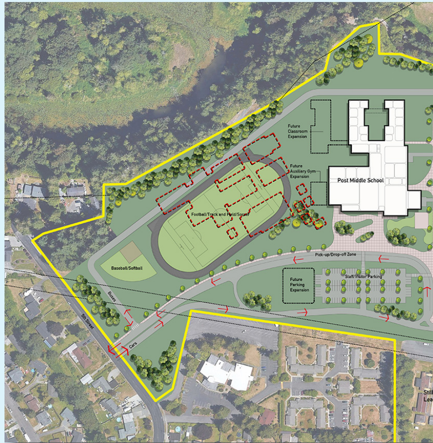
New Post Middle School (Existing school outlined in red, new school in white and built on same site as existing)