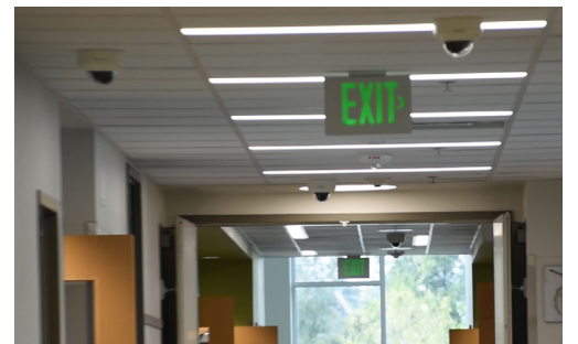
Examples of interior video cameras