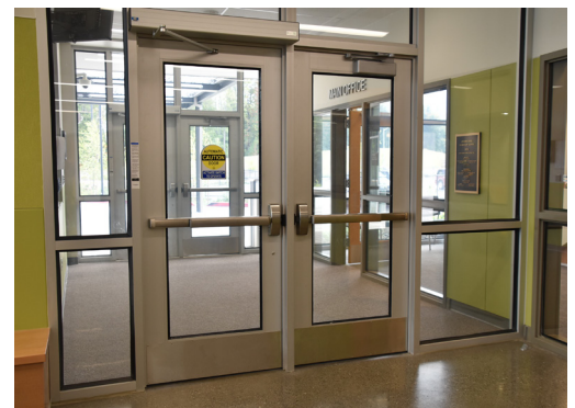
Example of a secured entry vestibule