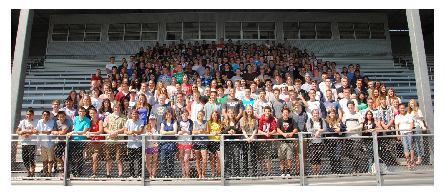
Wishing success to our 22 Weston High School Graduates