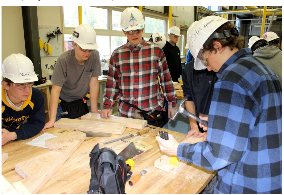
AHS Construction Geometry students use geometry as they collaborate to make stairs.