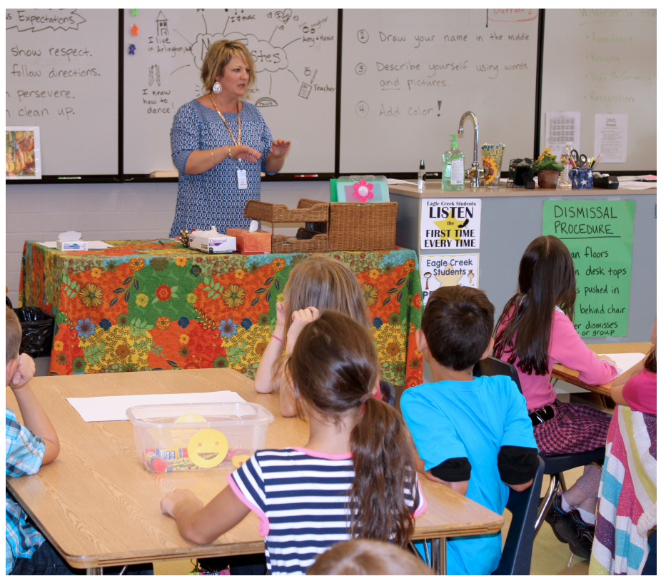
Eagle Creek Elementary students listen attentively on the first day of school.